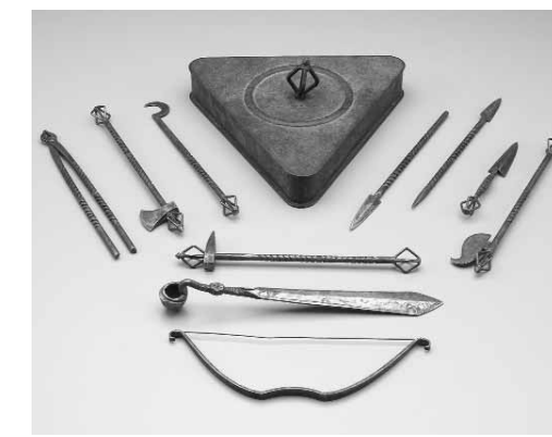
Tibetan Tantric Demon Quelling Set 19th C. iron / 9"x3.5"x9" Permanent Collection, Tibet House, New York City

The mandate of the Canadian Clay & Glass Gallery is to foster interaction among artworks, artists and community. The Wheel of Time was a wonderful example of the success of this vision. The Gallery, providing the exhibition and supplemental activities, interacted with members of the local and international Buddhist communities who played significant roles in helping to achieve this exhibition - a truly collaborative effort.