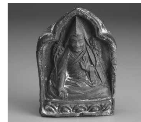
Tsa Tsa - possibly Tson-Ka-Pa, Founder of the Yellow Hat Sect 19th C. clay / 3"x3" Permanent Collection, Art Gallery of Greater Victoria

The Wheel of Time - an incredibly important exhibition within the Gallery's history - was a project which took four years to realize. The cooperation, support and collegial hard work of many people and organizations from across Canada and the United States made it possible.